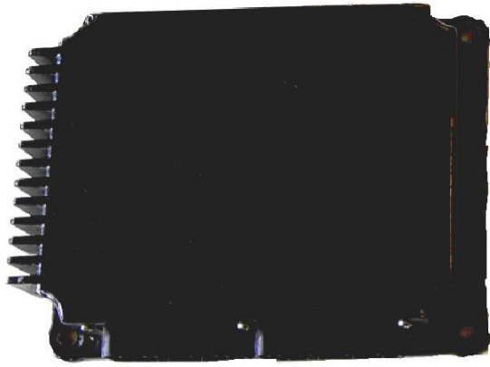
Older Version 1.1 Controller - NOT Included in Recall